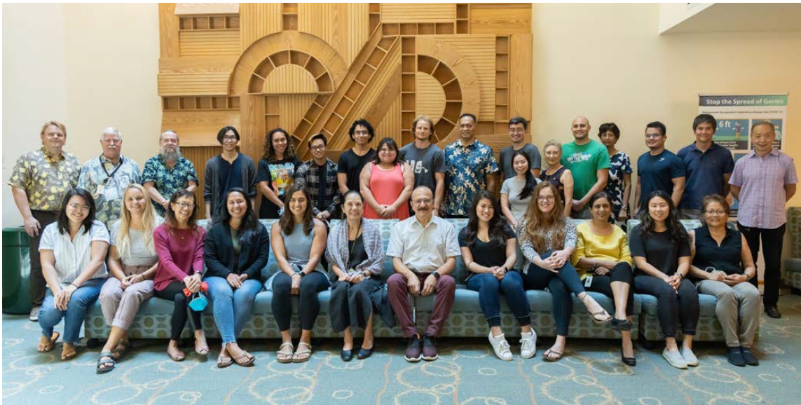
TROPICAL MEDICINE STUDENTS AND FACULTY