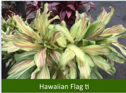
Hawaiian Flag ti