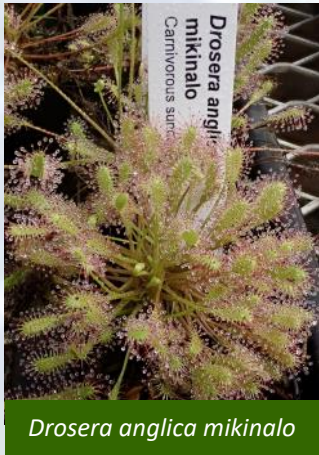
Drosera anglica mikinalo