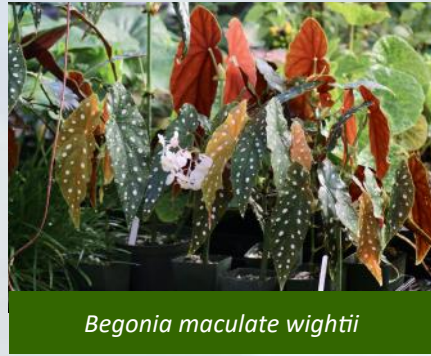
Begonia maculate wightii