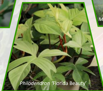
Philodendron 'Florida Beauty'