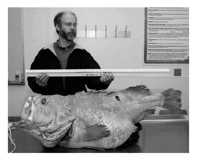
Figure 1. A big (1.1 m), old (ca.100 years), fat (27.2 kg), fecund female fish, in this case a shortraker rockfish ( Sebastes borealis ) taken off Alaska (Karna McKinney, Alaska Fisheries Science Center, NOAA Fisheries Service).

Herein, we review the biological traits that vary with fish size and/or age and the implications of these traits for population resilience. We do not explicitly consider the economic benefits or costs of management strategies that preserve BOFFFFs. For many fisheries,