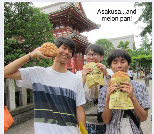
Asakusa...and melon pan!

I enjoyed living on my own for the first time. Besides that, I really enjoyed exploring the cities, especially Shibuya. I did not go into many stores there, but I walked around and just liked the feeling of the city. It seemed like a very lively and happening place because there were so many people, buildings, and shops. There was also the food factor. I was able to eat tonkotsu ramen which was rich and creamy. I tried a type of katsu called menchi katsu, which had a ground beef filling, and it has become my new favorite katsu. I also liked the yakitori and pretty much all the food I had in Japan.