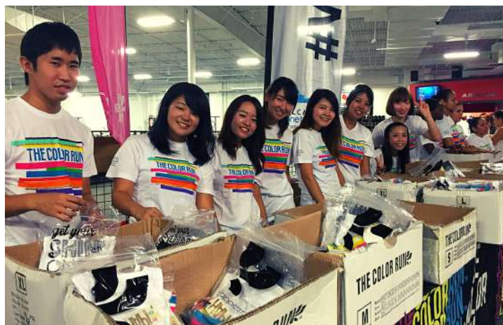
HELP students volunteering at The Color Run.

Service Learning is a valuable connection for our students to the local community, and every HELP student must complete at least 3 hours of Service Learning each month.