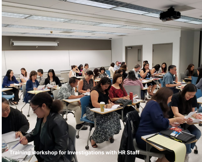
Training workshop for Investigations with HR Staff