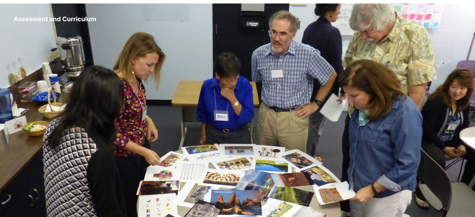
Assesment and Curriculum