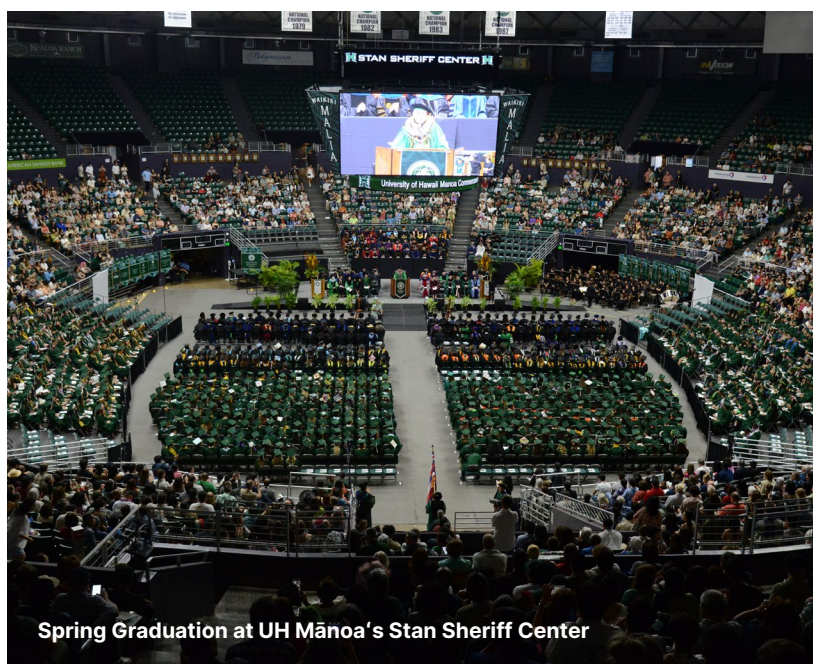
Spring Graduation at UH Mānoa's Stan Sheriff Center