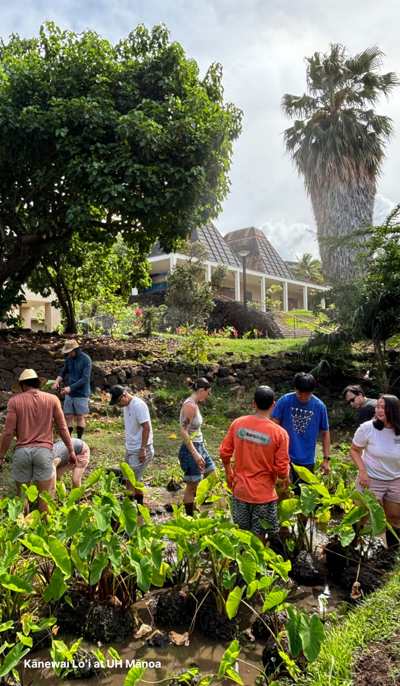
Kānewai Lo'i at UH Mānoa