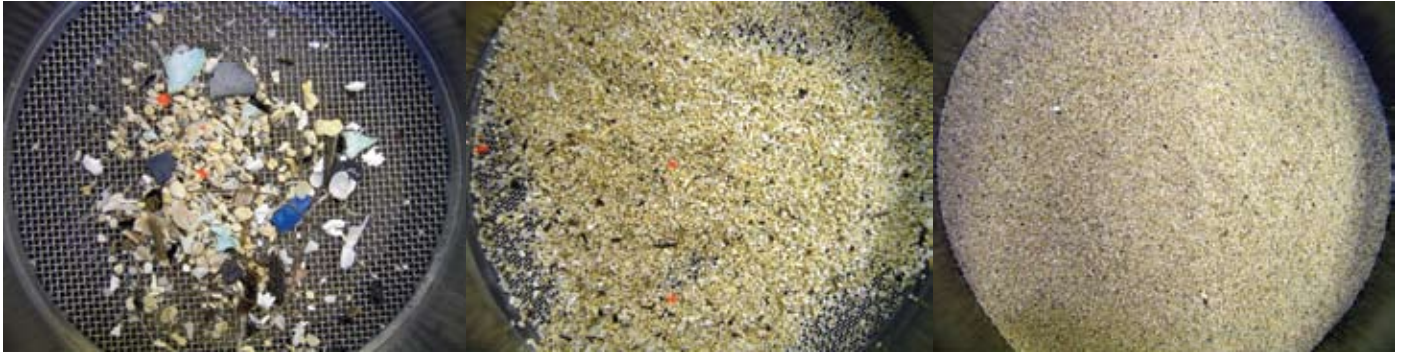
Figure 2. Beach sand sifted in sieves to show very coarse (2 mm), coarse (1 mm), and medium (0.5 mm) sand grains. Note the blue, black, light green, and orange plastic pieces in the very coarse sieve.