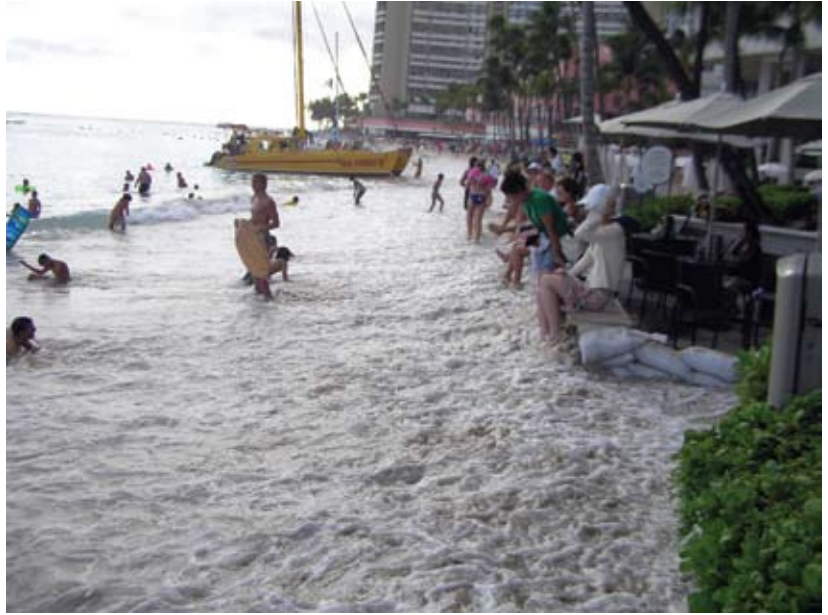
Figure 1. Beach loss caused by sand deficiency, high tide, and wave action, intensified by coastal development near to the water's edge, Waikiki, Hawai'i.

Beach sand also contains many materials that are anthropogenic, or result from human influence, such as plastics. The quantity of plastics in beach sand may be influenced by proximity to streams and urban areas and the extent of human use, as well as ocean currents and wind directions. Plastics are dangerous in nature because they do not readily break down, or biodegrade. Marine life and seabirds can be harmed by consuming discarded plastics or by becoming entangled in them. In fact, a single piece of plastic may remain in the aquatic environment, polluting beaches, for hundreds