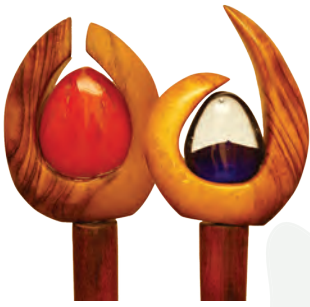
Female ko'o and Male ko'o