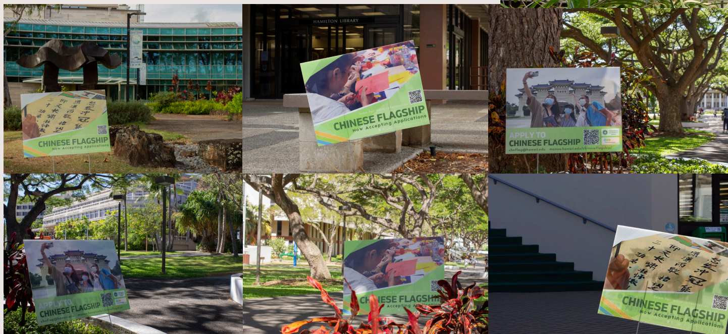
Some of the many Chinese Flagship program and study abroad promotional signs found across the UH Manoa campus (Moore Hall, Biomedical Sciences building, Hamilton Library, McCarthy Mall, Warrior Recreation Center, Campus Center)