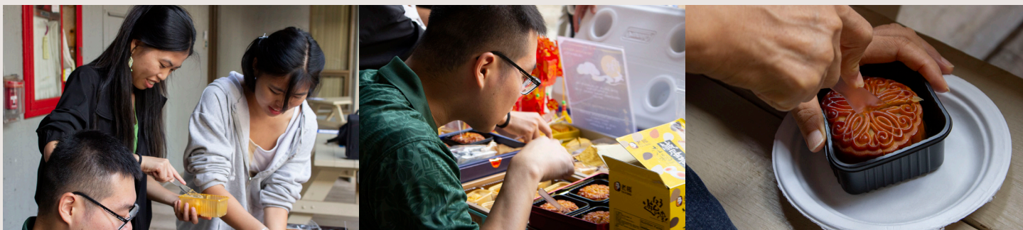
The Mid-Autumn Festival Celebration participants excitedly digging into their specially prepared mooncakes