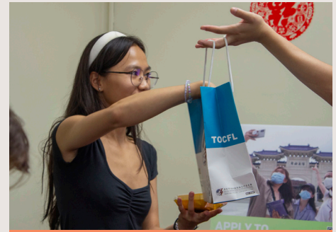
A participant receiving their prize after winning a mahjong competition