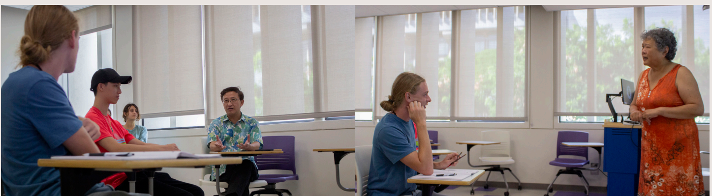
Dr Ning invites the Chinese Corner attendees to exchange their thoughts and impressions of the presentation with one another