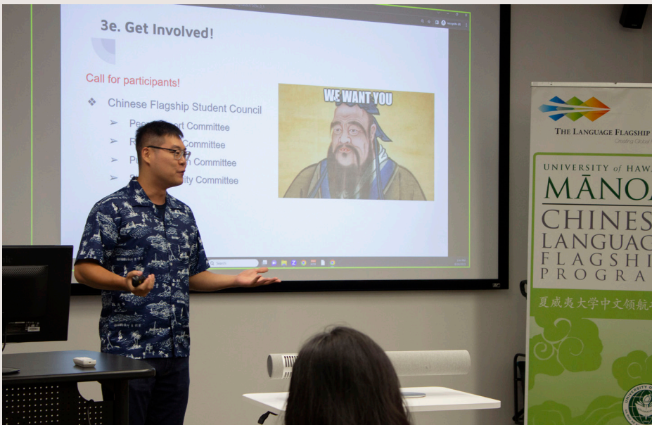
The GA Hsin-Tzu Jen promoting Chinese Flagship Student Council and announcing recruitment openings for any interested Flagship students