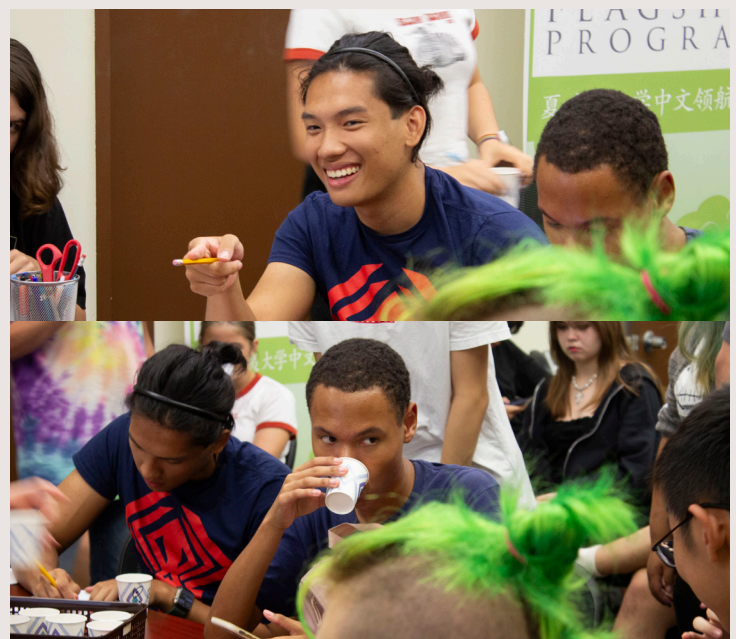
Participants enthusiastically participating in the competitive tea flavor matching game