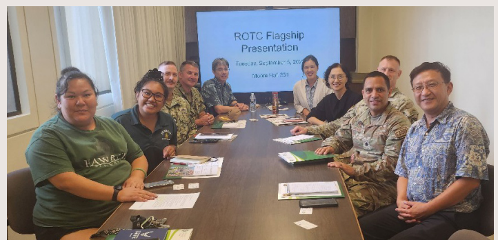
Group photo at the ROTC Flagship Presentation meeting