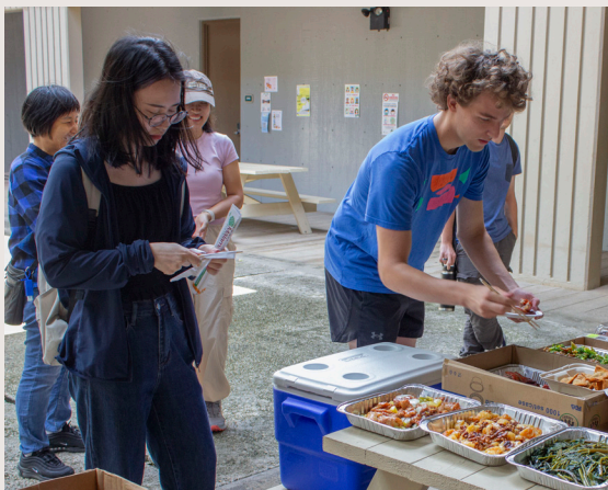
Attendees filling their plates with all kinds of eats from the wide arrangement of mouth watering food, drinks, and desserts