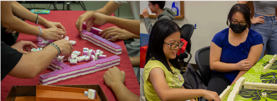
Chinese Corner attendees practicing what they learned and playing mahjong with each other