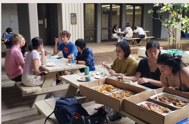
The event commences as attendees from all sorts of backgrounds chatter amongst themselves while enjoying the food