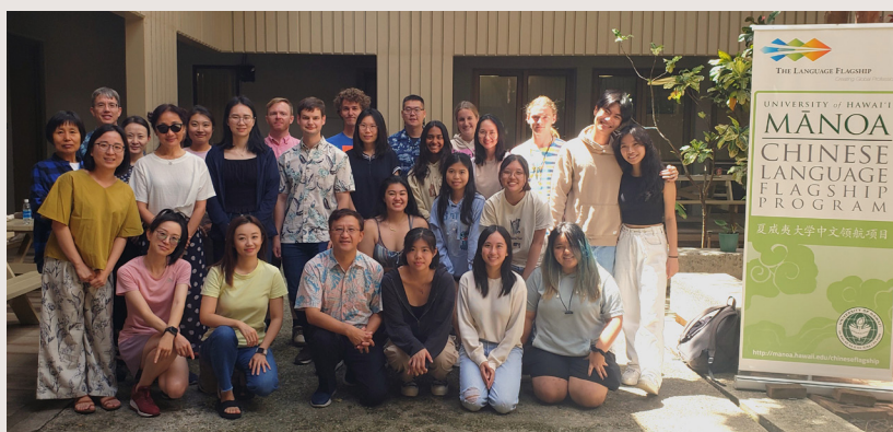
The crowd at the Chinese Table event gathering together for a commemorative group photo in the Biomedical Building Courtyard