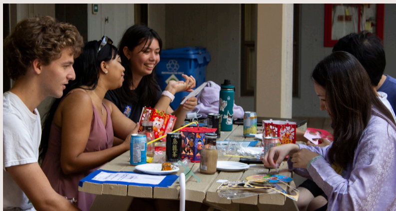
Students conversing in Chinese over mooncakes and drinks in the courtyard