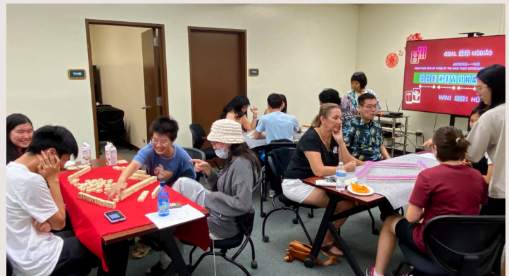
Students split into small groups to play Mahjong amongst themselves