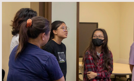
CLFC students introducing themselves and lining up based on their birthdays

The Teambuilding Workshop involved an icebreaker game where participants competed to see who could connect all of their classmates' English and Chinese names to their profile photos. A discussion about "how to be a good study abroad teammate" followed, and the session ended with role plays on how to use teamwork to overcome possible cross-cultural scenarios. (Orion)