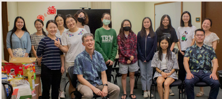
Group photo of Chinese GAs, CLFC staff, and CLFC students celebrating the end of Spring 23 semester