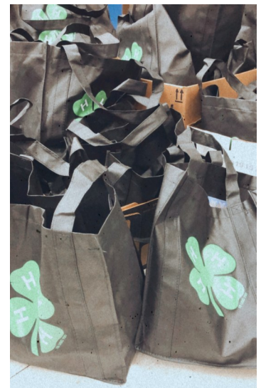
Completed Blessings Bags that needed to be delivered.

Mahalo for everyone's support for our first Collection Drive! Mahalo to Youth for Oahu and Blue Zones Project for providing a Youth-led Mini Grant for our organization to use our hands to give back to the community!