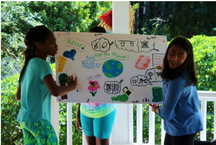
Youth share their posters with the group on what they learned and what they will do in the future to help the environment. They will take the posters back to their programs to share with friends and family.

In Hawaii, we were able to help connect youth to nature by offering 4-H environmental day camp opportunities to youth in Honolulu's YMCA youth programs and Military Youth programs. So far in 2016, 84 youth joined 4-H at the Urban Garden Center in Pearl City to explore nature. Youth explored the gardens through a variety of hands on activities including activities in water conservation, recycling, and gardening. At the end of the day, youth create posters about conservation to share with others at their youth programming sites.