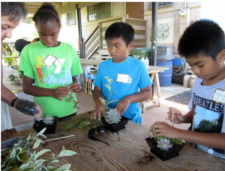
Youth learned about water conservation from volunteers from the Xeriscape Hui. Youth planted xeriscape plants to take home.

Time to Re-Enroll on 4HOnline (military sites please disregard this article)