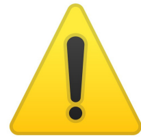
Not responsive or sleeping, but can't be woken