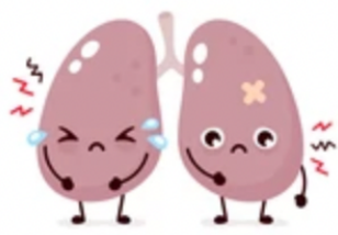
Slow & shallow breathing