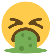
Vomiting or gurgling