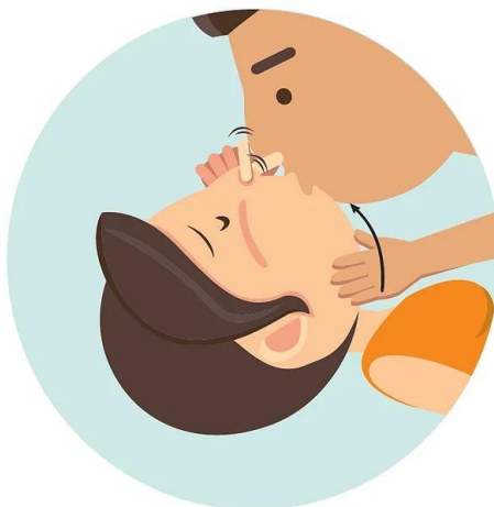
If comfortable, perform rescue breaths