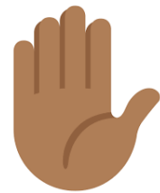
Blue/gray lips or fingernails